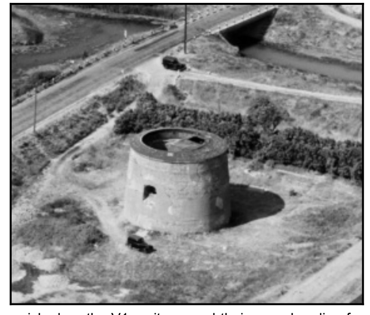
and F clusters, had been warned and they too picked up the V1 as it crossed their area, heading for

Top photo shows Obs Woodland and Obs Wraight on duty at the M2 Dymchurch Post. Below shows a 1949 photo of Martello Tower No 25. Note what appears to be a WW2 type ROC aircraft reporting post in the top of the tower, including instrument pedestal and flat laying glass panels.